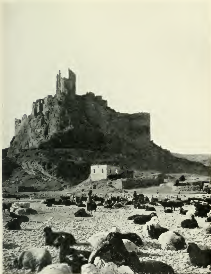
HOSHAB : A RELIC OF THE ARMENIAN KINGDOM